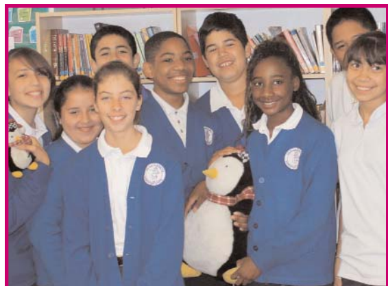
The 6th grade winners of this year's Koins for Kids at Saint Elizabeth pose with Pia Penguin.

Each year the schools run a month-long collection of coins and currency. Students and families have been extraordinarily generous. Beyond the monetary contributions of the